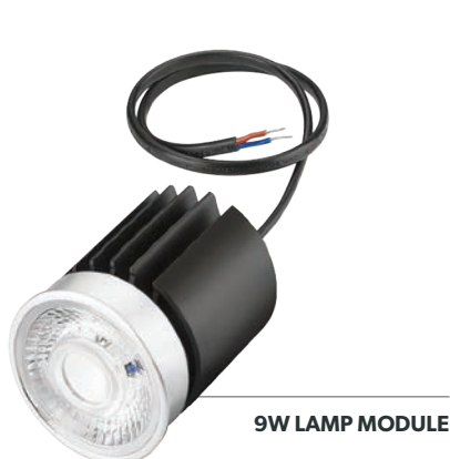
9W LAMP MODULE