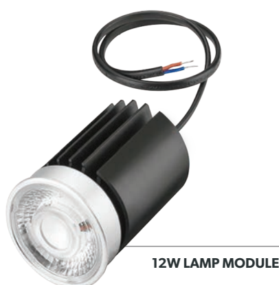
12W LAMP MODULE