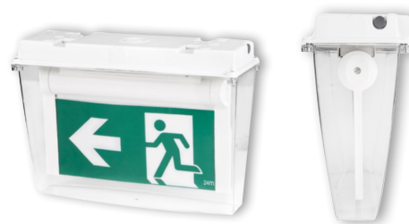
AQUA LOCK-W (IP65) with LED Blade