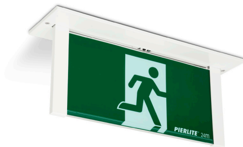
LEDXM2P-L & LEDRB